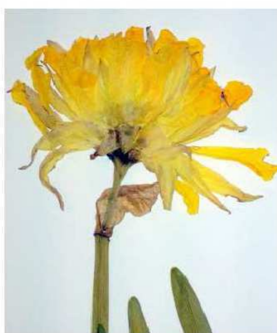
(b) Double yellow form